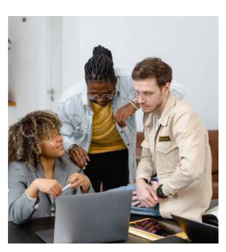
There is no duplication of the integrated data.

Integrated Cloud based administration of Tax, Time, Debtors and Company Secretarial for accounting firms. Data between various disciplines is fully integrated and shared. Unlimited user licence which is cost effective for the whole firm as well as free webinars for your whole firm saving substantial amounts.